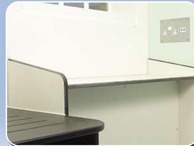
• Desk Unit - c/w half-depth knee area underneath (optional)