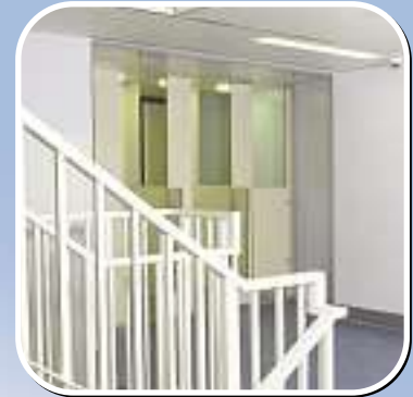
• Prison Wing Bulkhead Ducting, enclosing services into cells and incorporating lighting, smoke detection, sprinkler system, air plenum, and service access doors (detailed)