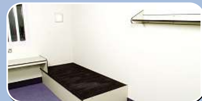
• View: Desk; Corner Bed & Shelf Unit