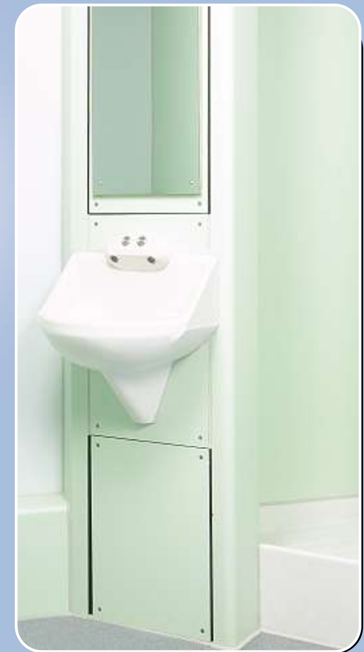
• In-Cell Wall Cladding to form Shower Cubicle, incorporating post-formed Trespa panelling