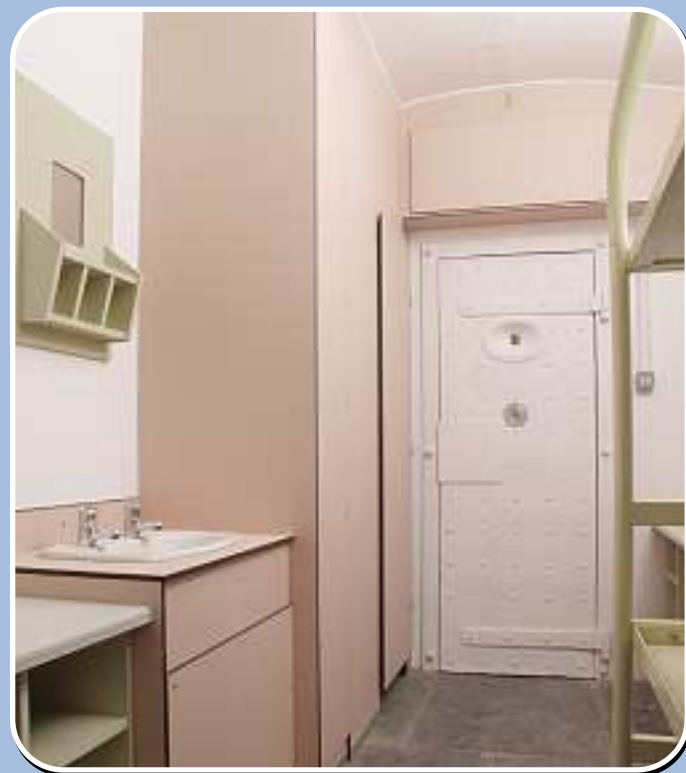
• Refurbishment of Victorian vaulted ceiling prison cell to incorporate: WC Cubicle; Vanity Unit; Service Riser and Bulkhead

LEP have an extensive and ever growing range of furniture and equipment suitable for prison and detention centre environments. We have a comprehensive range of existing modular designs available to meet both standard cell and safer cell applications. Bespoke furniture can also be readily and economically designed and manufactured via our fabrication processes in order to meet each establishments individual and exacting requirements.