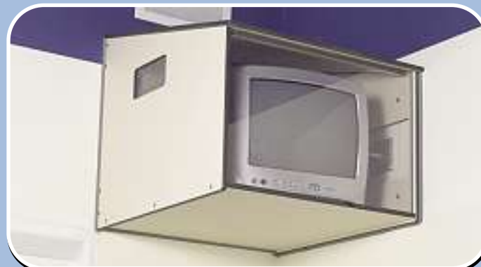
• Right-Hand & Left-Hand High Level Fully Enclosed TV Cabinets, incorporating Polycarbonate Screen and Anti-Ligature Mesh Sound and Heat Dissipation Grille

LEP are also manufacturers and installers of :- WC Cubicles; Shower Cubicles; Lockers; Benching; Ducts; Vanity Units; Kitchen furniture; Special purpose furniture etc..... indeed any product or application where Trespa solid resin board is perceived to be a suitable material We would be pleased to discuss the requirements of your project