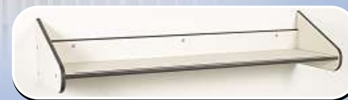
• Wall Mounted Shelf, incorp. Clothes-Hanging Facility