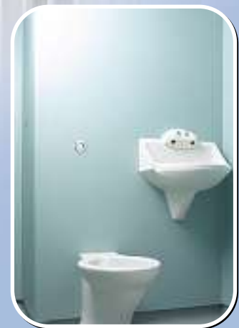
• Above: Gatehouse WC; WC Area Ducting; En-suite Wall Cladding; Telephone Booths; Prison Wing Communal Shower Facilities